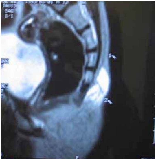
Figure 1 represents a sagittal MRI image of the sacral bone of a 6 years boy after insertion of two plastic cannula showing the direction of the sacral hiatus and showing the direction of trans-sacral route. After preparation and local anesthetic

Statistical test were performed using SPSS 11 for Windows. Results are reported as absolute value, mean \pm SD. Continuous variables were analyzed using Student's T test. Nominal or ordinal variables were analyzed by Chi square test and Fisher exact test or Mann-Whitney U test. P < 0.05 was considered statistically significant.